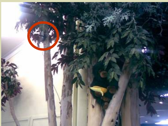
Kaiapoi's WAP in a tree

Here are some examples of what we are after.