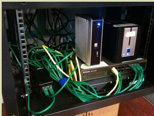
Photogenic boxes and plugs