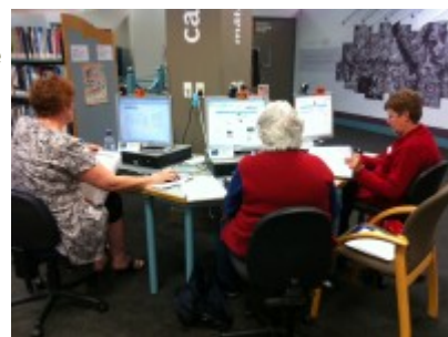
Three not-necessarily related genealogists use APNK PCs at Hamilton’s Night @ the Library event.

“[We] really appreciate the service [APNK] provide us, especially extending the hours of access. We couldn’t run the event without Internet access, especially WiFi.”